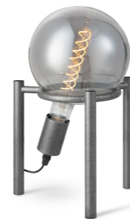
TLT7047-01GM burned metal E27, bulb not incl. ↔ 30 x 20 cm ↓ 30 cm