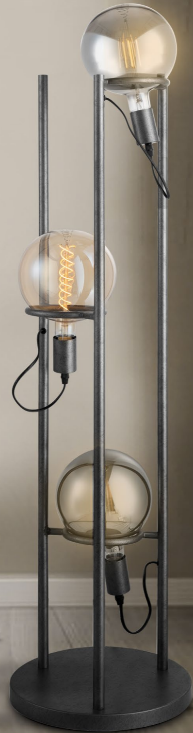
perfect match TLB-8012-06CL LED GLOBE G150 | clear