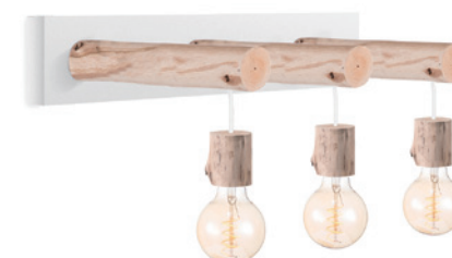
TLW3013-03SW sand white natural 3 x E27, bulb not incl. ↔ 48 x 20 cm ↑ 22 cm