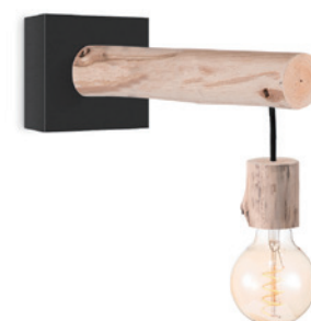
TLW3013-01SB sand black natural E27, bulb not incl. ↔ 10 x 20 cm ↑ 21.5 cm