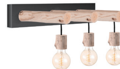
TLW3013-03SB sand black natural 3 x E27, bulb not incl. ↔ 48 x 20 cm ↑ 22 cm