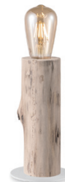
TLT1093-01SW sand white natural E27, bulb not incl. Ø 12 cm 22.5 cm