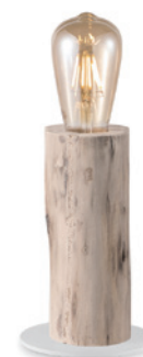
TLT1099-01SW sand white natural E27, bulb not incl. Ø 10 cm 18.5 cm