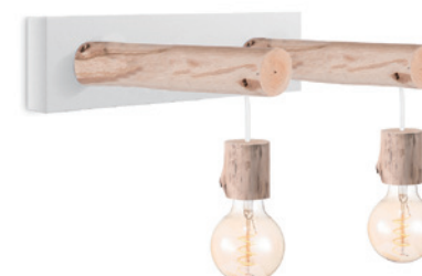
TLW3013-02SW sand white natural 2 x E27, bulb not incl. ↔ 29 x 20 cm ↑ 22 cm