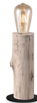
TLT1093-01SB sand black natural E27, bulb not incl. Ø 12 cm 22.5 cm