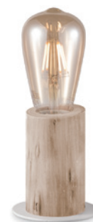
TLT1094-01SW sand white natural E27, bulb not incl. Ø 6.5 cm 11.5 cm