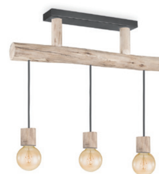
TLP4114-03SB sand black natural 3 x E27, bulb not incl. 60 x 8.5 cm 140 cm