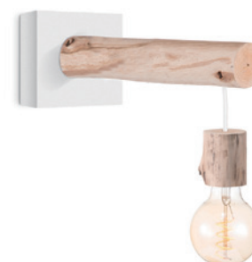
TLW3013-01SW sand white natural E27, bulb not incl. ↔ 10 x 20 cm ↑ 21.5 cm