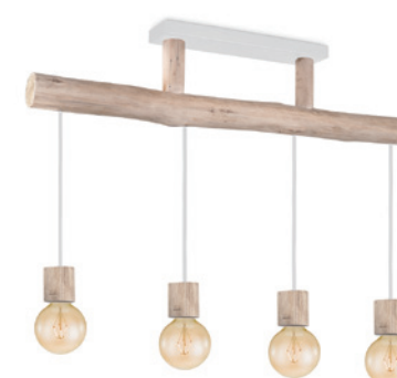
TLP4114-04SW sand white natural 4 x E27, bulb not incl. 80 x 8.5 cm 140 cm