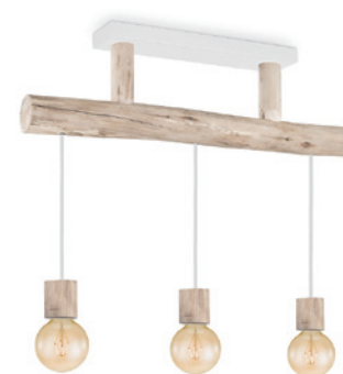
TLP4114-03SW sand white natural 3 x E27, bulb not incl. 60 x 8.5 cm 140 cm