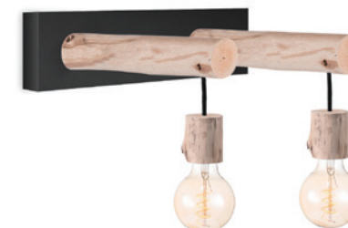
TLW3013-02SB sand black natural 2 x E27, bulb not incl. ↔ 29 x 20 cm ↑ 22 cm