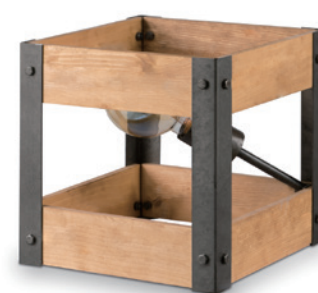
TLT1086-01NTGM pine wood burned metal

☞ E27, bulb not incl. ↔ 18 x 18 cm ↕ 45 cm