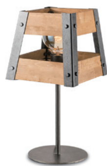
TLT1087-01NTGM pine wood burned metal

☞ E27, bulb not incl. ↔ 18 x 18 cm ↕ 45 cm