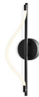
TLW7064-18SB sand black