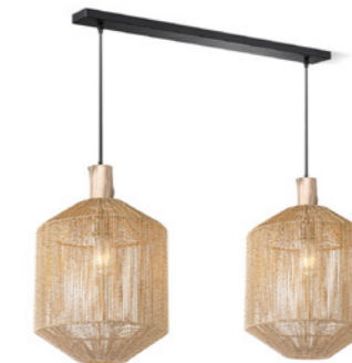
TLP7197-04NT natural 2 x E27, bulb not incl. ↔ 80 x 33 cm ↓ 166 cm