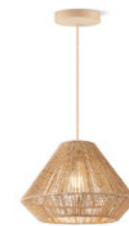
TLP7194-02NT natural E27, bulb not incl. Ø 25 cm ↓ 137 cm