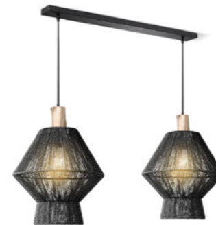
TLP7197-03BK black 2 x E27, bulb not incl. 80 x 35 cm 160 cm