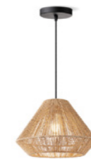
TLP7193-02NT natural E27, bulb not incl. Ø 25 cm ↓ 137 cm