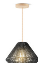
TLP7194-02BK black E27, bulb not incl. Ø 25 cm ↓ 137 cm