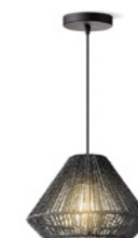
TLP7193-02BK black E27, bulb not incl. Ø 25 cm ↓ 137 cm