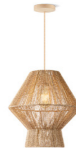
TLP7194-03NT natural E27, bulb not incl. Ø 35 cm ↓ 156 cm