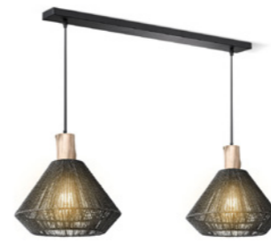
TLP7197-01BK black 2 x E27, bulb not incl. 80 x 20 cm 137 cm