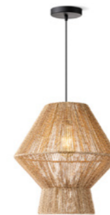
TLP7193-03NT natural E27, bulb not incl. Ø 35 cm ↓ 156 cm