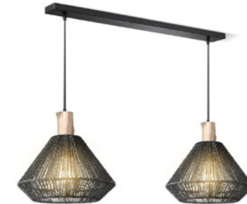
TLP7197-02BK black 2 x E27, bulb not incl. 80 x 25 cm 141 cm