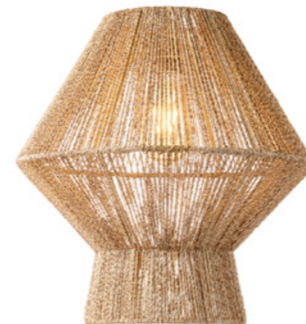
TLS7192-03NT natural E27 Ø 35 cm ↓ 37 cm