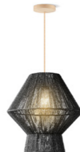
TLP7194-03BK black E27, bulb not incl. Ø 35 cm ↓ 156 cm