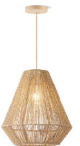
TLP7194-05NT natural E27, bulb not incl. Ø 33 cm ↓ 156 cm