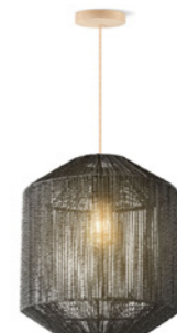
TLP7194-04BK black E27, bulb not incl. Ø 33 cm ↓ 163 cm