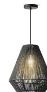
TLP7193-05BK black E27, bulb not incl. Ø 33 cm ↓ 156 cm