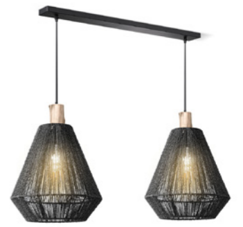
TLP7197-05BK black 2 x E27, bulb not incl. 3 80 x 33 cm 166 cm

perfect match TLB-8001-04AM LED DECO ST64 | amber