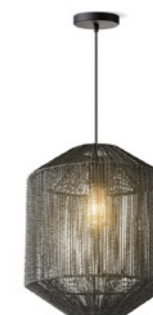
TLP7193-04BK black E27, bulb not incl. Ø 33 cm ↓ 163 cm