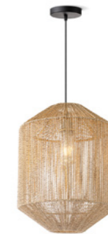
TLP7193-04NT natural E27, bulb not incl. Ø 33 cm ↓ 163 cm