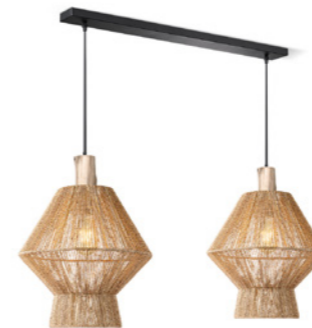
TLP7197-03NT natural 2 x E27, bulb not incl. ↔ 80 x 35 cm ↓ 160 cm