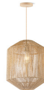
TLP7194-04NT natural E27, bulb not incl. Ø 33 cm ↓ 163 cm