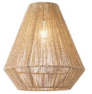
TLS7192-05NT natural E27 Ø 33 cm ↓ 37 cm