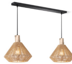
TLP7197-01NT natural 2 x E27, bulb not incl. ↔ 80 x 20 cm ↓ 137 cm

perfect match TLB-8001-04AM LED DECO ST64 | amber