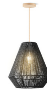
TLP7194-05BK black E27, bulb not incl. Ø 33 cm ↓ 156 cm