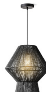
TLP7193-03BK black E27, bulb not incl. Ø 35 cm ↓ 156 cm