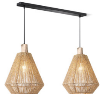
TLP7197-05NT natural 2 x E27, bulb not incl. ↔ 80 x 33 cm ↓ 160 cm