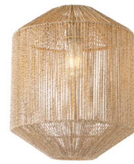
TLS7192-04NT natural E27 Ø 33 cm ↓ 43 cm