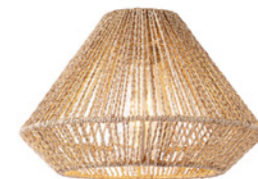
TLS7192-02NT natural E27 Ø 25 cm ↓ 18 cm