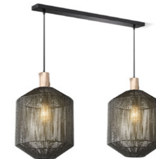
TLP7197-04BK black 2 x E27, bulb not incl. 80 x 35 cm 160 cm