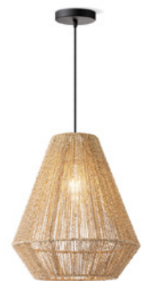
TLP7193-05NT natural E27, bulb not incl. Ø 33 cm ↓ 156 cm