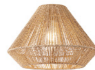
TLS7192-01NT natural E27 Ø 20 cm ↓ 14 cm

perfect match TLB-8001-04AM LED DECO ST64 | amber