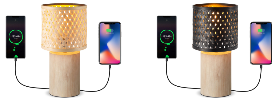
TLT7526-01ANT natural E27, bulb not incl. Ø 18 cm ↓ 35 cm