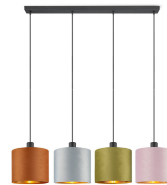
TLP7503-04SBV sand black 4 x E27, bulb not incl. ↔ 98 x 25 cm ↓ 146.5 cm