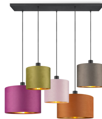
TLP7505-05SBV sand black 5 x E27, bulb not incl. ↔ 98 x 45 cm ↓ 150.5 cm