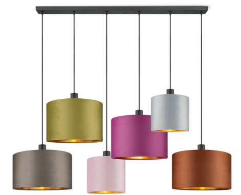
TLP7504-06SBV sand black 6 x E27, bulb not incl. ↔ 120 x 45 cm ↓ 150.5 cm