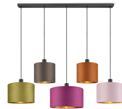
TLP7504-05SBV sand black 5 x E27, bulb not incl. ↔ 120 x 45 cm ↓ 150.5 cm