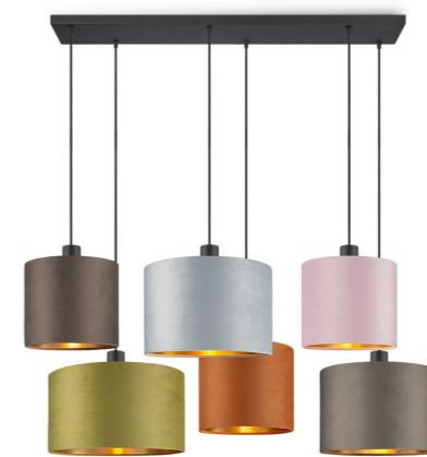
TLP7505-06SBV sand black 6 x E27, bulb not incl. ↔ 98 x 45 cm ↓ 150.5 cm