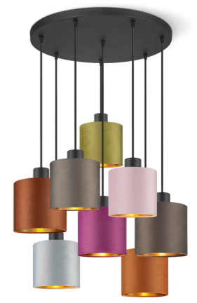
TLP7509-08SBV sand black 8 x E27, bulb not incl. Ø 50 cm ↓ 144.5 cm