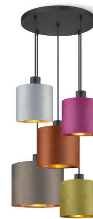
TLP7508-03SBV sand black 5 x E27, bulb not incl. Ø 40 cm ↓ 147.5 cm