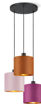
TLP7507-03SBV sand black 3 x E27, bulb not incl. Ø 35 cm ↓ 146.5 cm