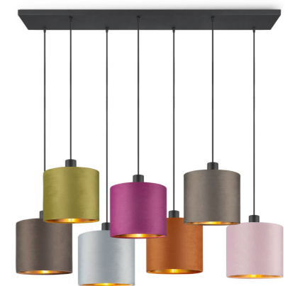
TLP7506-07SBV sand black 7 x E27, bulb not incl. ↔ 120 x 25 cm ↓ 146.5 cm