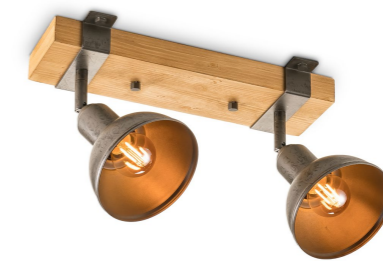
TLS7082-01GM burned metal

☰ E14 , bulb not incl. ↔ 18 x 11.5 cm ↓ 20.5 cm