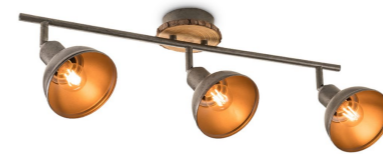
TLS7083-03GM burned metal

☰ 2 x E14 , bulb not incl. ↔ 41 x 11 cm ↓ 20.5 cm