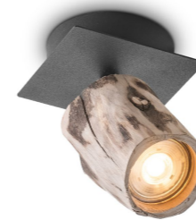
TLS7080-01SB sand black

☰ GU10 , bulb not incl ↔ 14.5 x 10 cm ↓ 14.5 cm