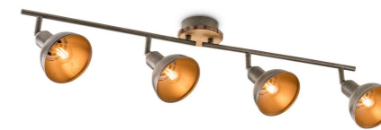
TLS7083-04GM burned metal

☰ 3 x E14 , bulb not incl. ↔ 64 x 11 cm ↓ 20.5 cm