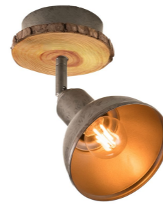
TLS7083-01GM burned metal

☰ E14 , bulb not incl. ↔ 18 x 11.5 cm ↓ 20.5 cm