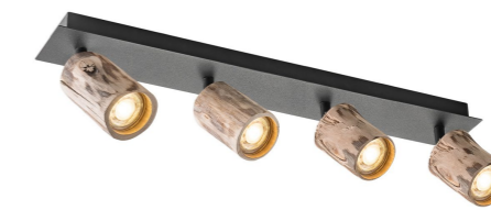
TLS7080-04SB sand black

☰ 3 x GU10 , bulb not incl ↔ 45.5 x 10 cm ↓ 14.5 cm