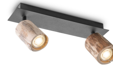
TLS7080-02SB sand black

☰ GU10 , bulb not incl ↔ 14.5 x 10 cm ↓ 14.5 cm