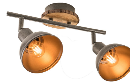
TLS7083-02GM burned metal

☰ E14 , bulb not incl. ↔ 18 x 11.5 cm ↓ 20.5 cm