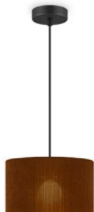
TLP7706-35BR brown E27 35 cm 124 cm