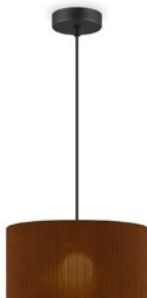
TLP7706-40BR brown E27 40 cm 125 cm