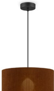
TLP7706-50BR brown E27 50 cm 126 cm