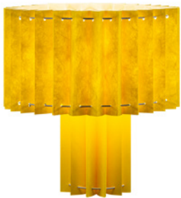
TLT7702-35YL yellow E27 ↔ 35 cm ↑ 40 cm