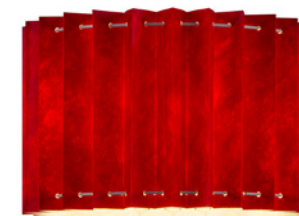
TLS7702-40RD red E27 40 cm 22 cm