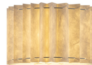
TLS7702-40WT white E27 40 cm 22 cm