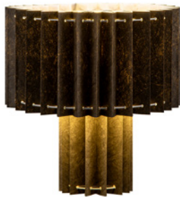
TLT7702-35BK black E27 ↔ 35 cm ↑ 40 cm