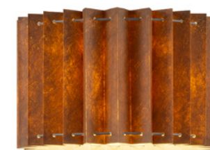
TLS7702-40BR brown E27 40 cm 22 cm