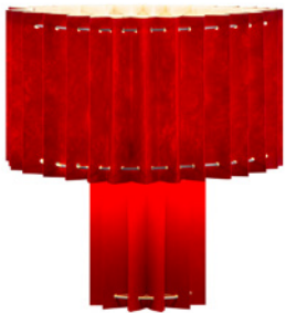
TLT7702-35RD red E27 ↔ 35 cm ↑ 40 cm