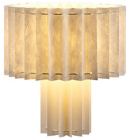
TLT7702-35WT white E27 ↔ 35 cm ↑ 40 cm