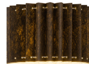
TLS7702-40BK black E27 40 cm 22 cm